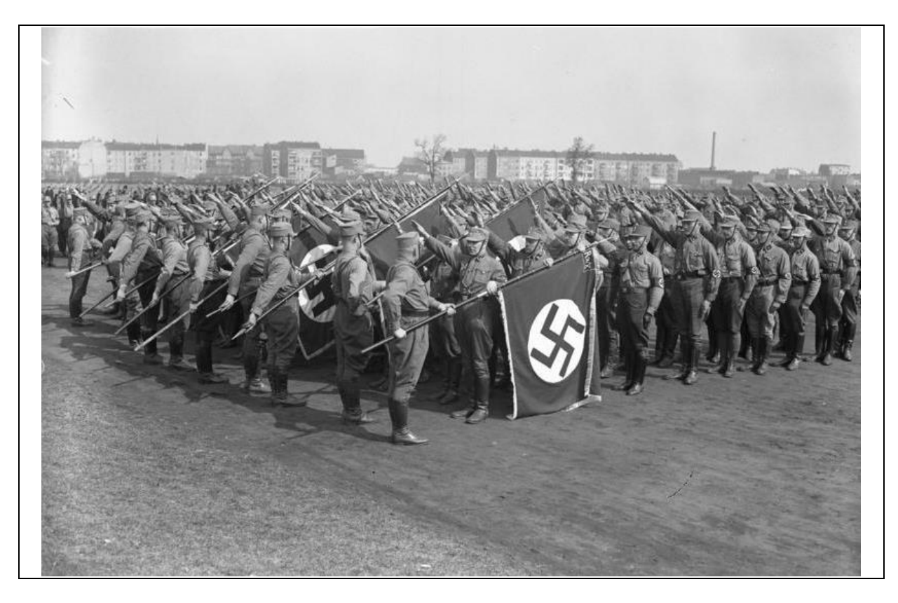
[A photograph showing SA members at a parade in Berlin, early 1932]

Use Source A and your own knowledge to describe the role of the SA.